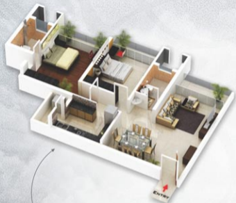
2 BHK Unit Plan